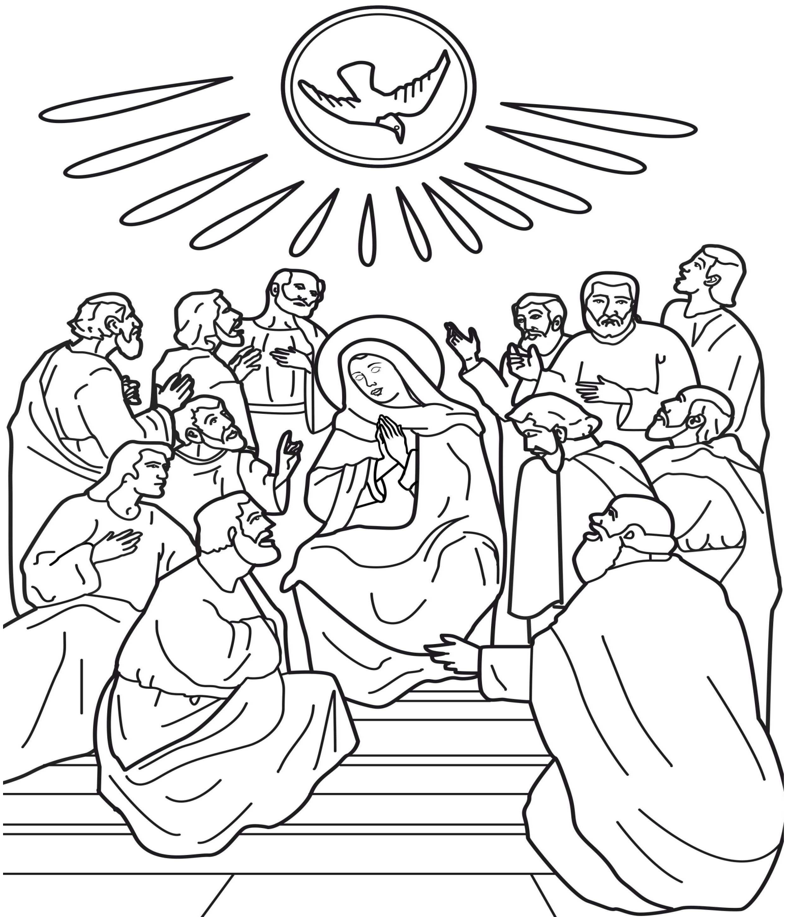
The Day of Pentecost Celebrated May 28th